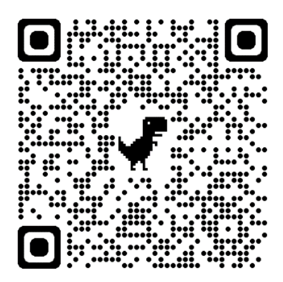
<u>The Session</u> Susan Perrotta, Recording Clerk

Yes, we're making our way into the 21<sup>st</sup> Century. This past week, we acquired a QR code. Simply put your cell phone into camera mode, hold it up to the funny little square thing (no need to take a photo), and the link to our church website should pop up. We will be updating our website within the next week or so. Stay tuned!